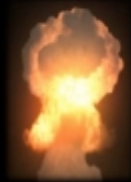
a BIG explosion

Please note that this last analogy is VERY significant, because it points out where evolution BEGINS as well as where it ENDS . People who argue about various so-called midpoints on the make-believe evolution timeline should instead concentrate on the TWO ENDPOINTS of evolution and see who is willing to BELIEVE THAT STORY WITHOUT LAUGHING!