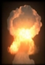
a BIG explosion

Evolutionists believe that in the course of a VERY VERY long time , an explosion they call "the big bang" created everything we see.