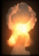
a BIG explosion

Please note that this last analogy is VERY significant, because it points out where evolution BEGINS as well as where it ENDS. People who argue about various so-called midpoints on the make-believe evolution timeline should instead concentrate on the TWO ENDPOINTS of evolution and see who is willing to BELIEVE THAT STORY WITHOUT LAUGHING!