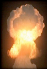
a BIG explosion

Please note that this last analogy is VERY significant, because it points out where evolution BEGINS as well as where it ENDS . People who argue about various so-called midpoints on the make-believe evolution timeline should instead concentrate on the TWO ENDPPOINTS of evolution and see who is willing to BELIEVE THAT STORY WITHOUT LAUGHING!