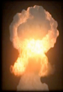
a BIG explosion

Evolutionists believe that in the course of a VERY VERY long time , an explosion they call “the big bang” created everything we see.